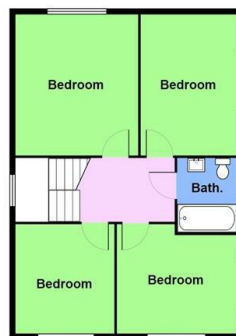
1st Floor Area: 56.0 m² ... 603 ft²