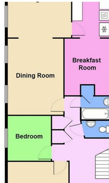
1st Floor Area: 44.5 m 2 ... 479 ft 2