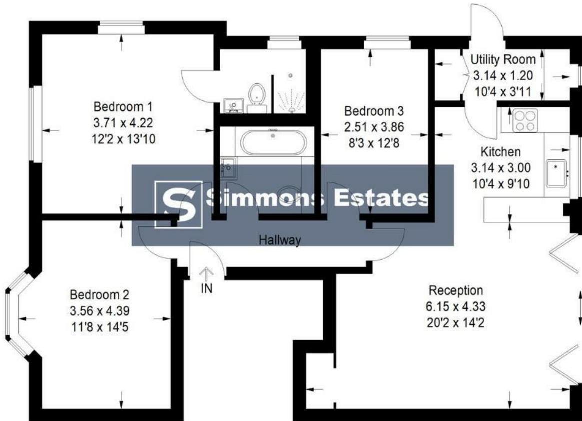
Illustration for identification purposes only, measurements are approximate, not to scale. (ID680107)

Approximate Gross Internal Area = 94.8 sq m / 1020 sq ft