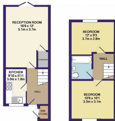
GROUND FLOOR APPROX. FLOOR AREA 331 SQ.FT. (30.7 SQ.M.)