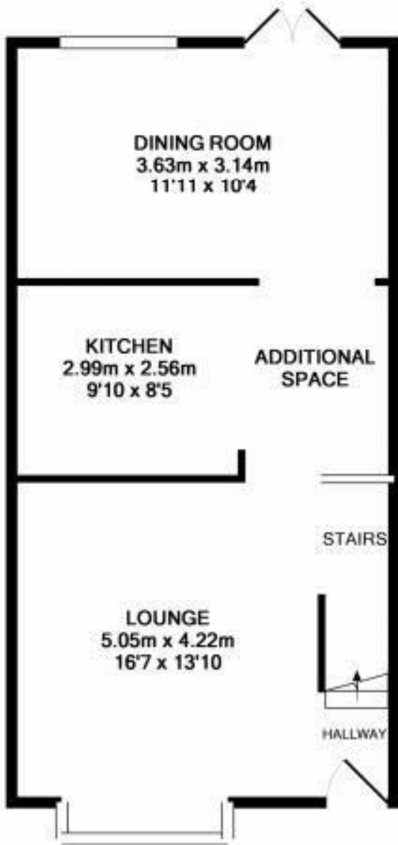
GROUND FLOOR APPROX. FLOOR AREA 50.3 SQ.M. (541 SQ.FT.)