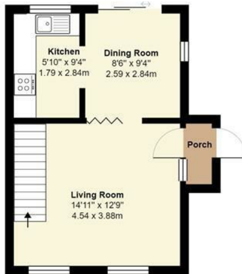
Ground Floor Area: 352 ft 2 ... 32.7 m 2