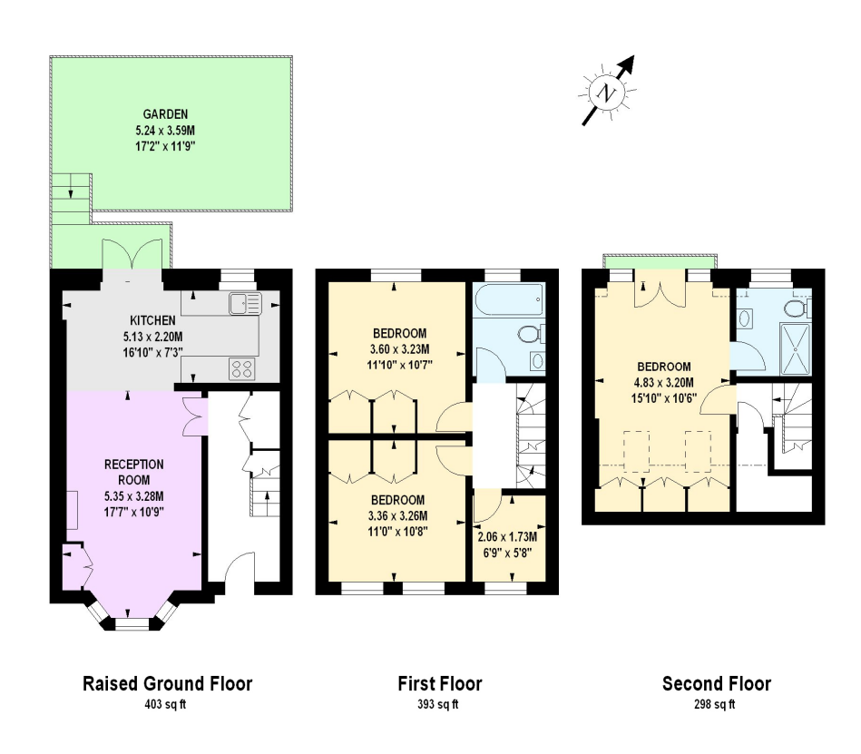
Illustration For Identification Purposes Only. Not To Scale *Floorplan Drawn According To RICS Guidelines Copyright of FeaturePRO

Approximate gross internal area 101.63 sq m / 1094 sq ft