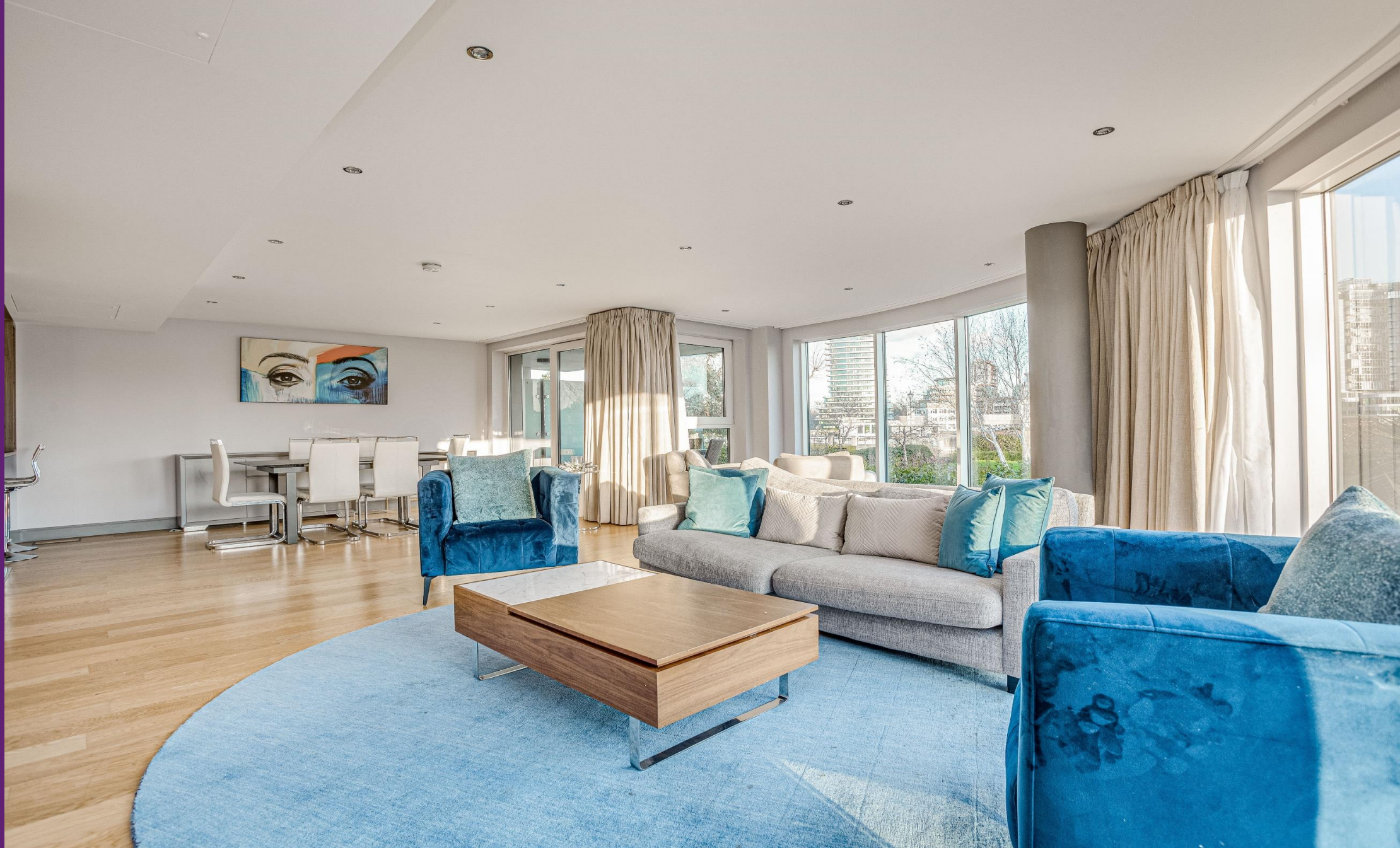
Banyan House Fulham, SW6