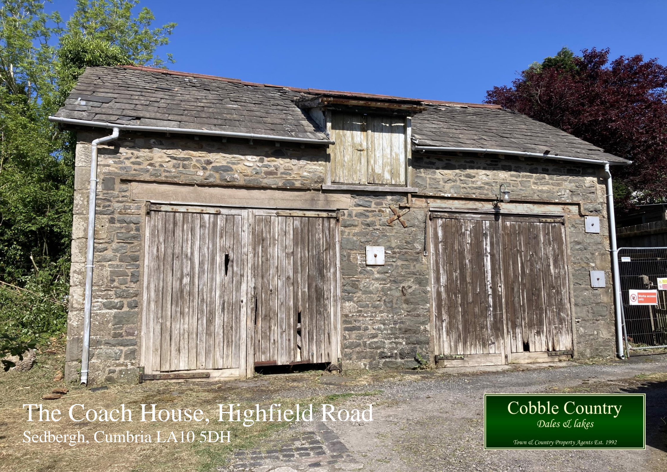
The Coach House, Highfield Road Sedbergh, Cumbria LA10 5DH