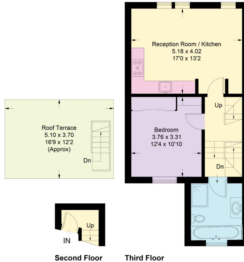
Illustration for identification purposes only, measurements are approximate, not to scale.

Chesterton Global Ltd trading as Chestertons for themselves and for the vendor of this property whose agents they are, give notice that (i) these particulars do not constitute any part of an offer or contract, (ii) all statements contained within these particulars are made without responsibility on the part of Chestertons or the vendor, (iii) whilst made in good faith, none of the statements contained within these particulars are to be relied upon as a statement or representation of fact, (iv) any intending purchasers must satisfy themselves by inspection or otherwise as to the correctness of each of the statements contained within these particulars, (v) the vendor does not make or give either Chestertons or any person in their employment any authority to make or give representation or warranty whatsoever in relation to this property. Wide angle lenses may be used. ©Copyright Chestertons | Chesterton Global Ltd | Registered Office 40 Connaught Street, Hyde Park, London W2 2AB Registered Company Number 05334580.