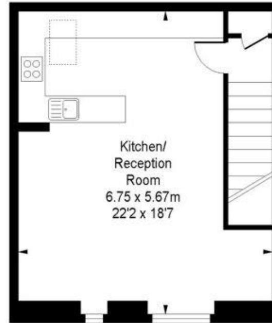
Second Floor Approximate Gross Internal Area 406 sq ft / 37.72 sq m

Chesterton Global Ltd trading as Chestertons for themselves and for the vendor of this property whose agents they are, give notice that (i) these particulars do not constitute any part of an offer or contract, (ii) all statements contained within these particulars are made without responsibility on the part of Chestertons or the vendor, (iii) whilst made in good faith, none of the statements contained within these particulars are to be relied upon as a statement or representation of fact, (iv) any intending purchasers must satisfy themselves by inspection or otherwise as to the correctness of each of the statements contained within these particulars, (v) the vendor does not make or give either Chestertons or any person in their employment any authority to make or give representation or warranty whatsoever in relation to this property. Wide angle lenses may be used. ©Copyright Chestertons | Chesterton Global Ltd | Registered Office 40 Connaught Street, Hyde Park, London W2 2AB Registered Company Number 05334580.