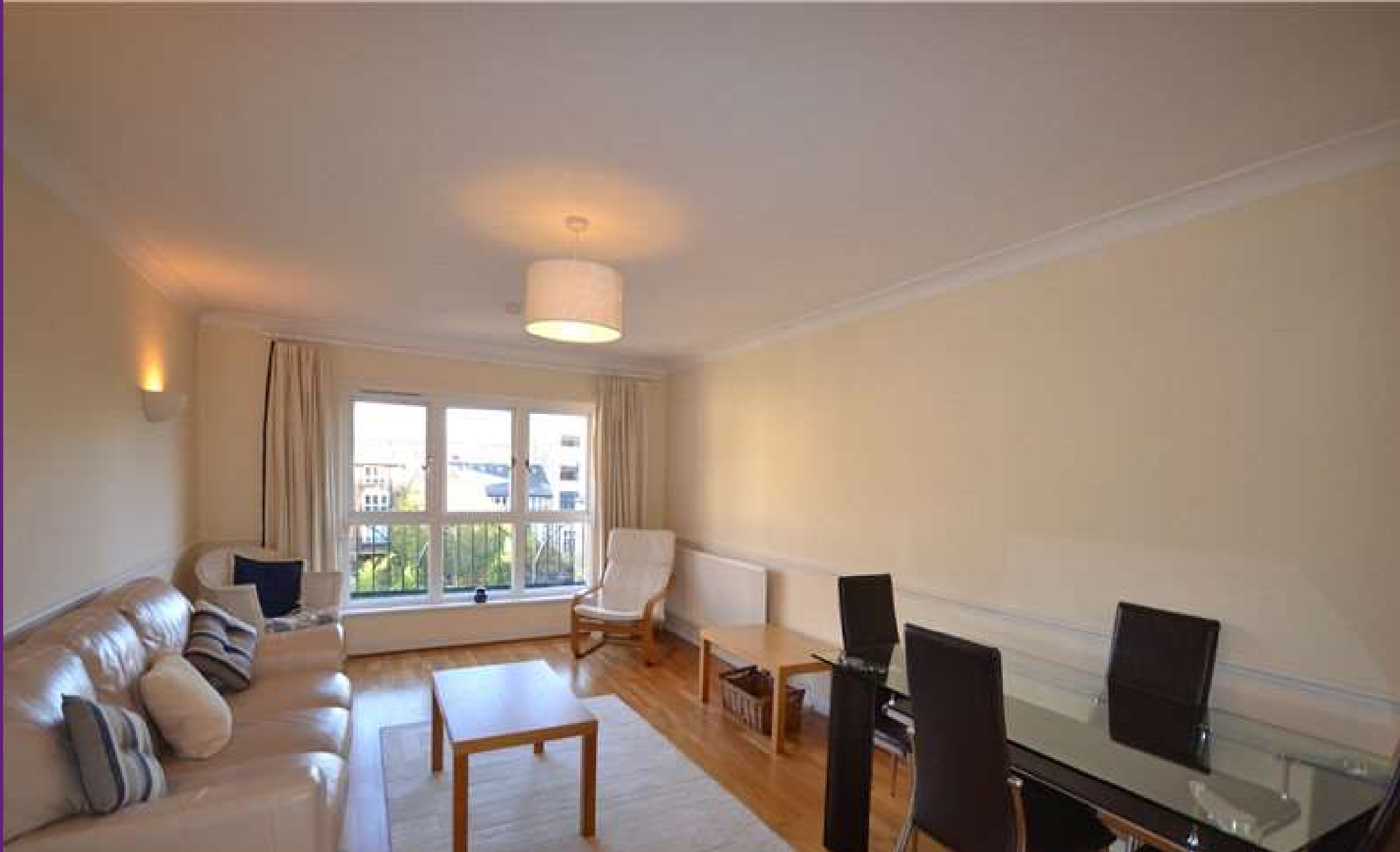
Knights House 75 Gainsford Street, SE1