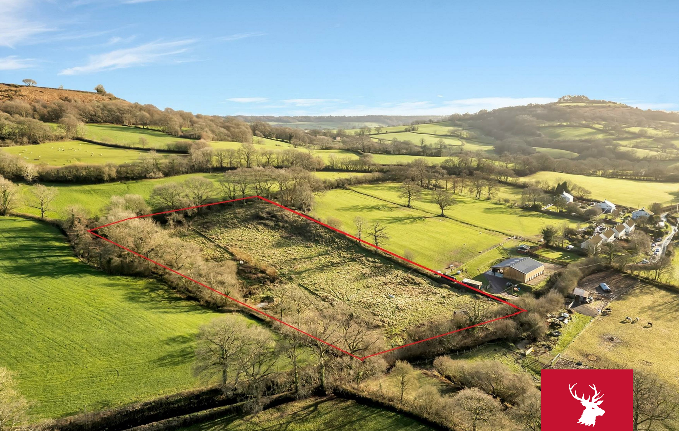
Land at Mill Rise