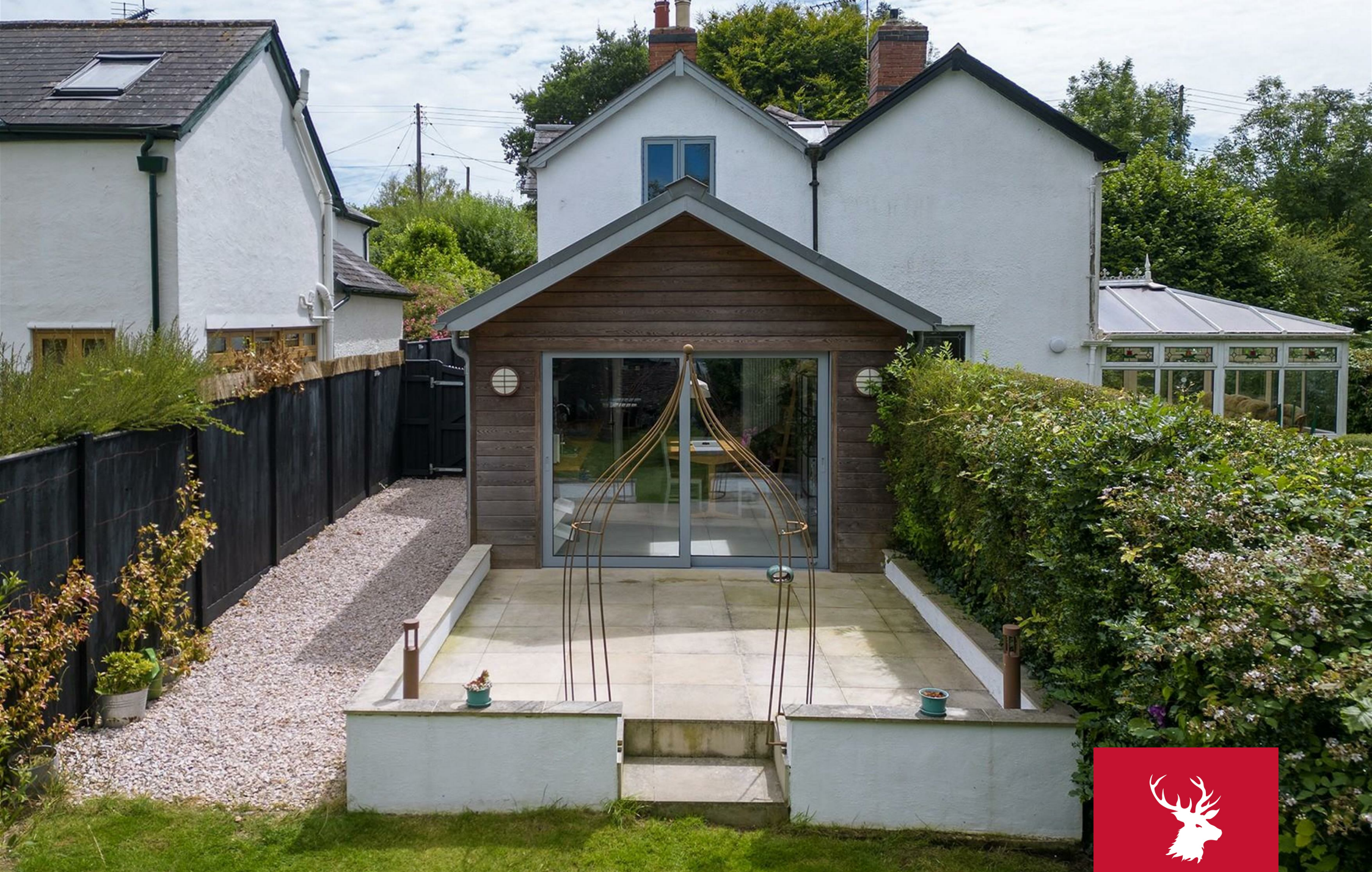
3 Bridge Cottages, Green Lane