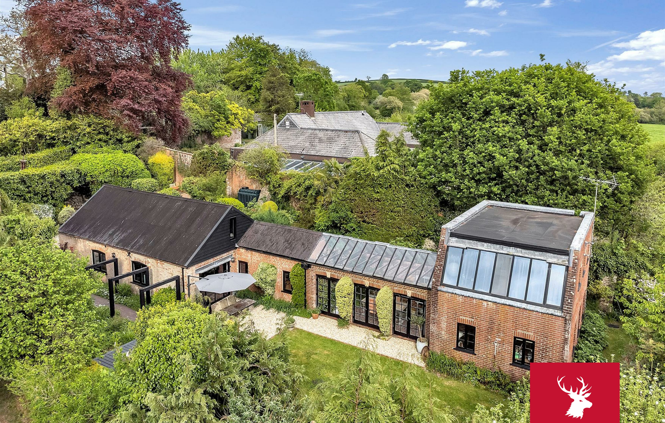
The Old Watermill