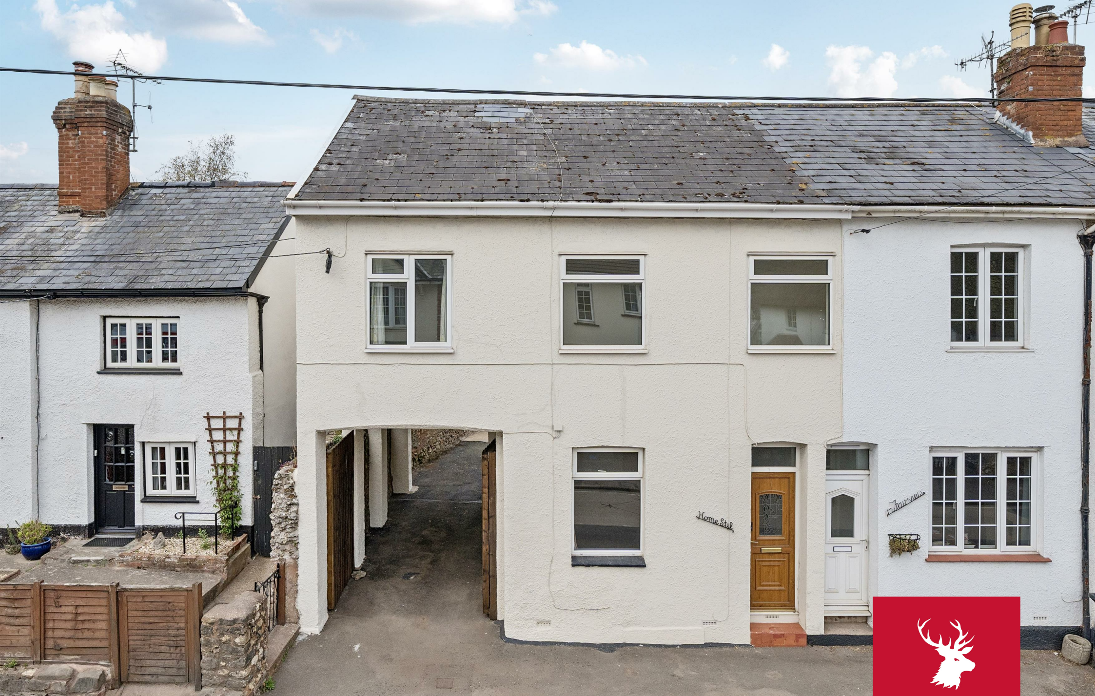
Homestill, 1 Fairview Church Street