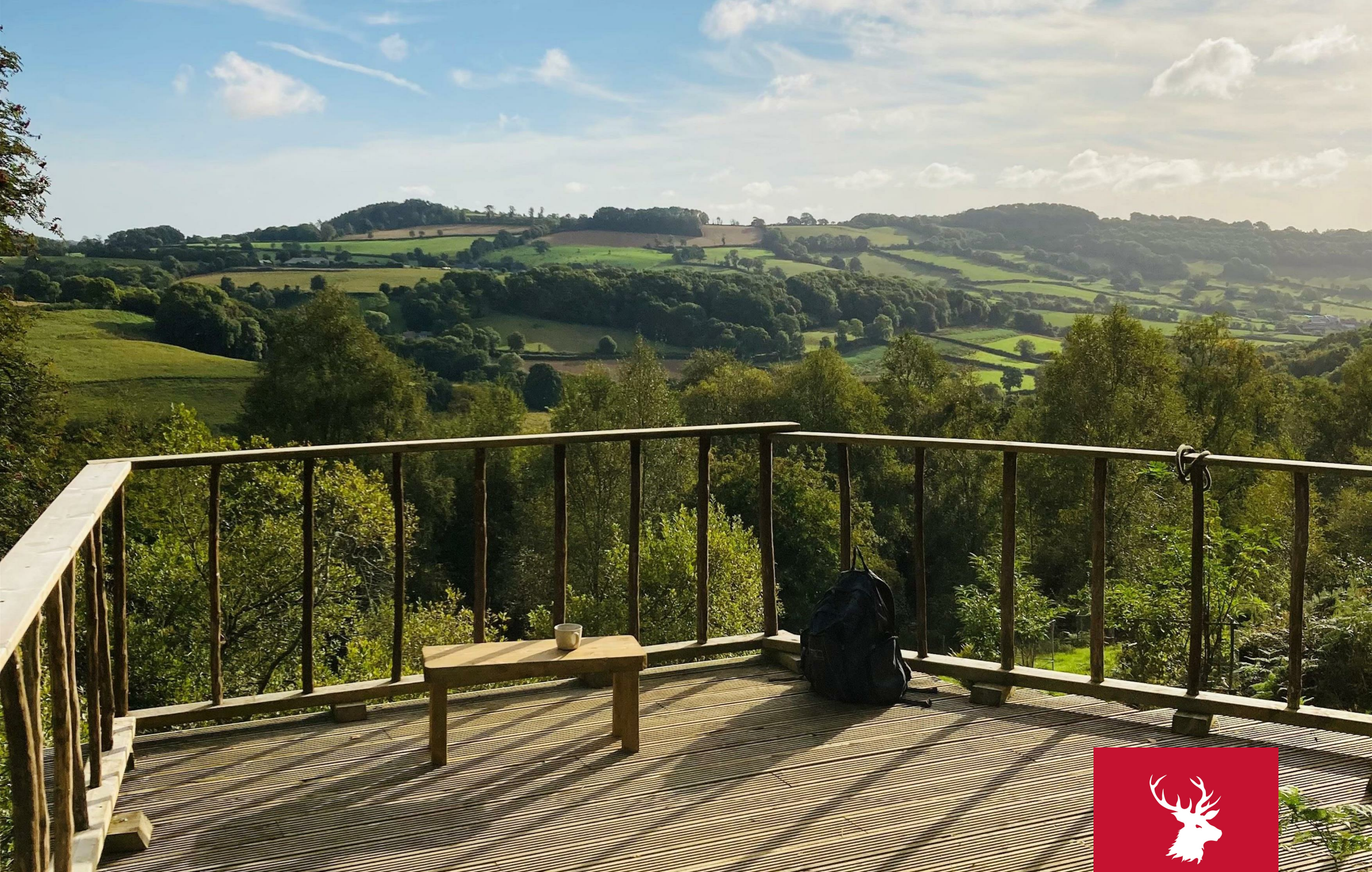
Bloomey Down Wood