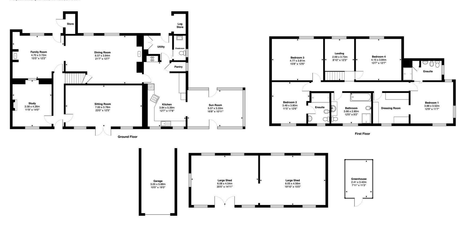
Total Area: 270.5 m² ... 2911 ft² (excluding garage, large shed, greenhouse)

This floor plan is for illustrative purposes only and is not to scale. All measurements are approximate and should not be relied upon. While every effort has been made to ensure accuracy, no responsibility is taken for any errors, omissions, or misstatements.