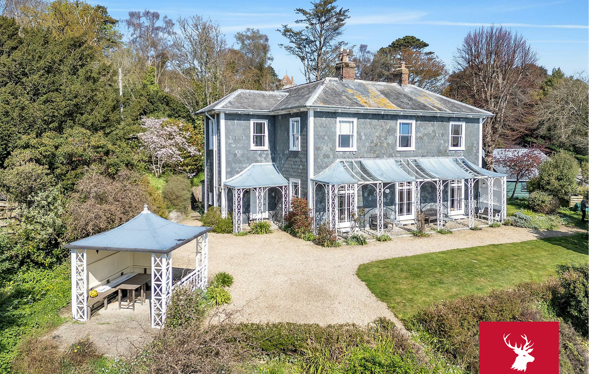
Holme Craig, Cobb Road