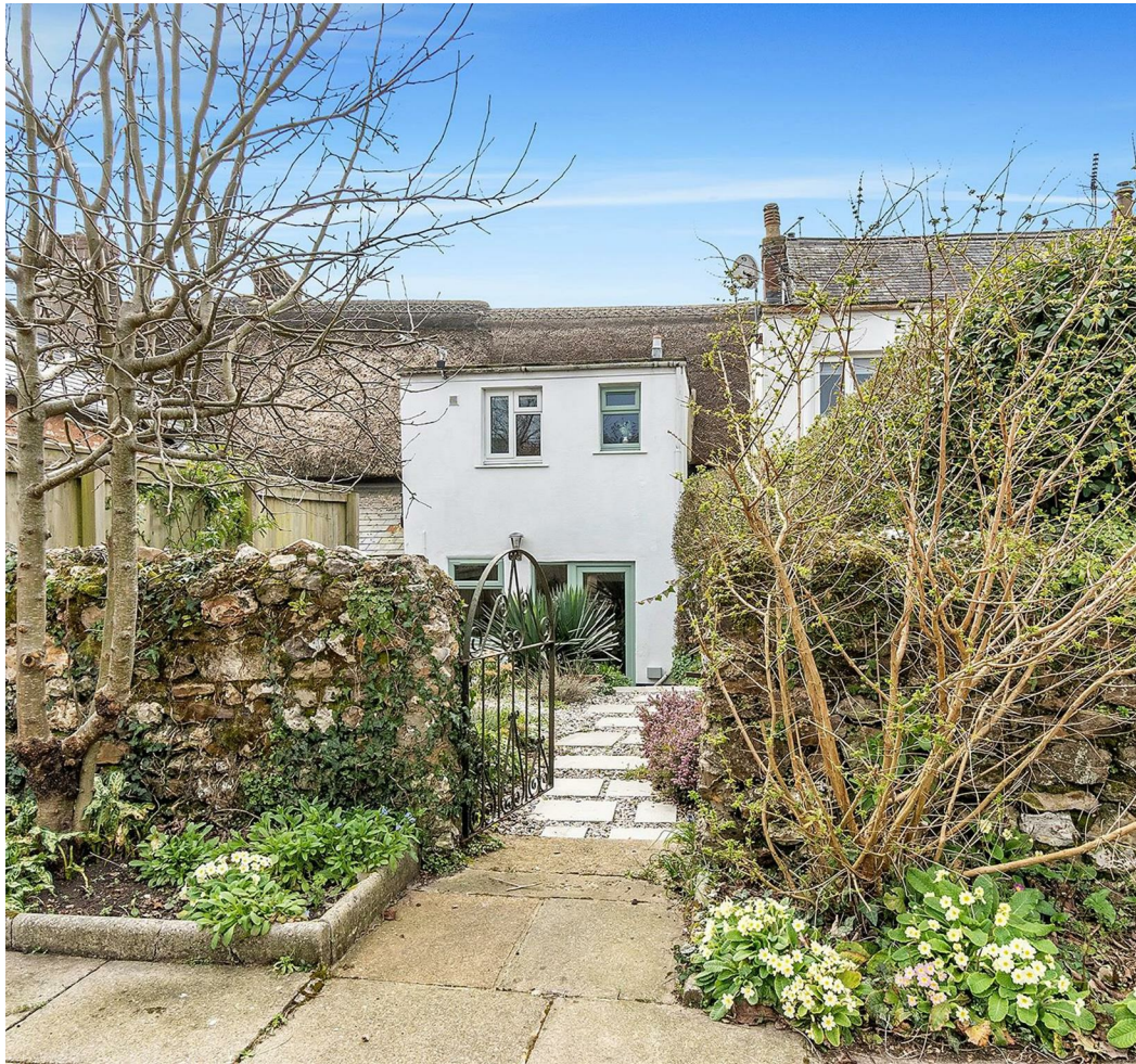
The Cottage, Church Street, Sidford, EX10 9RL

IMPORTANT: Stags gives notice that: 1. These particulars are a general guide to the description of the property and are not to be relied upon for any purpose. 2. These particulars do not constitute part of an offer or contract. 3. We have not carried out a structural survey and the services, appliances and fittings have not been tested or assessed. Purchasers must satisfy themselves. 4. All photographs, measurements, floorplans and distances referred to are given as a guide only. 5. It should not be assumed that the property has all necessary planning, building regulation or other consents. 6. Whilst we have tried to describe the property as accurately as possible, if there is anything you have particular concerns over or sensitivities to, or would like further information about, please ask prior to arranging a viewing.