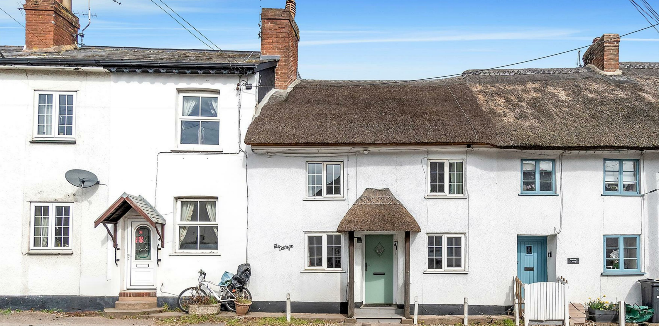
The Cottage, Church Street