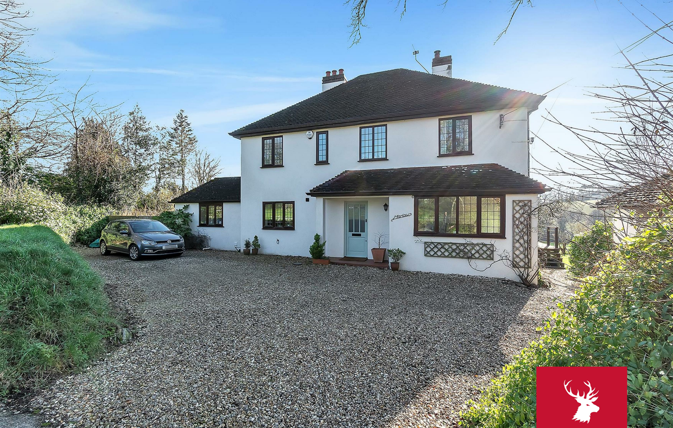
Marlow, Holyford Lane