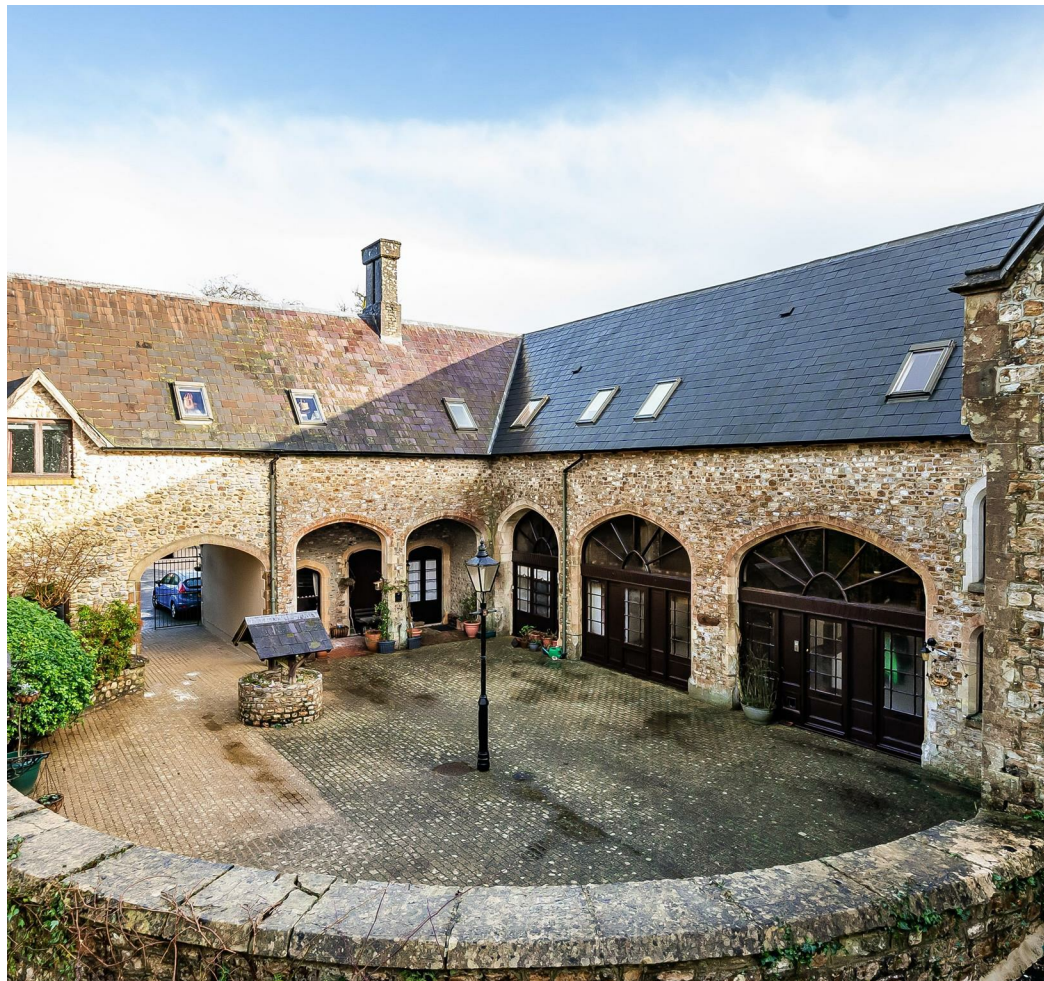
Bank House, 66 High Street, Honiton, Devon, EX14 1PS

IMPORTANT: Stags gives notice that: 1. These particulars are a general guide to the description of the property and are not to be relied upon for any purpose. 2. These particulars do not constitute part of an offer or contract. 3. We have not carried out a structural survey and the services, appliances and fittings have not been tested or assessed. Purchasers must satisfy themselves. 4. All photographs, measurements, floorplans and distances referred to are given as a guide only. 5. It should not be assumed that the property has all necessary planning, building regulation or other consents. 6. Whilst we have tried to describe the property as accurately as possible, if there is anything you have particular concerns over or sensitivities to, or would like further information about, please ask prior to arranging a viewing.