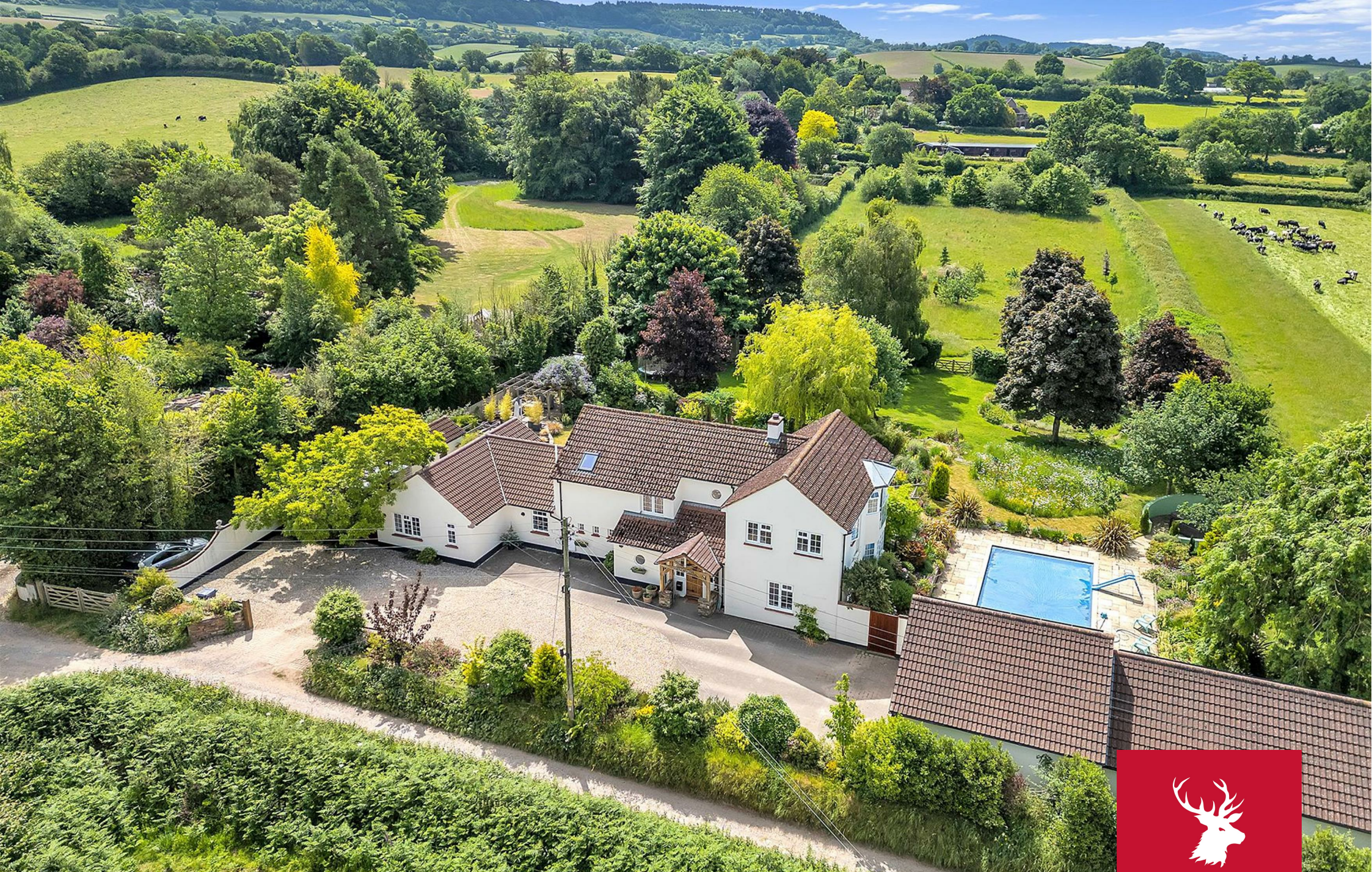
Wychbury, Sandgate Lane