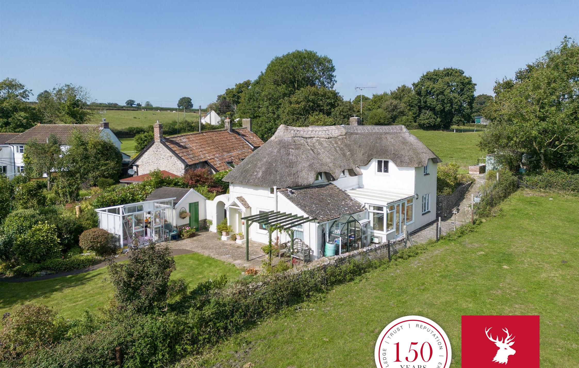
The Old Bakehouse