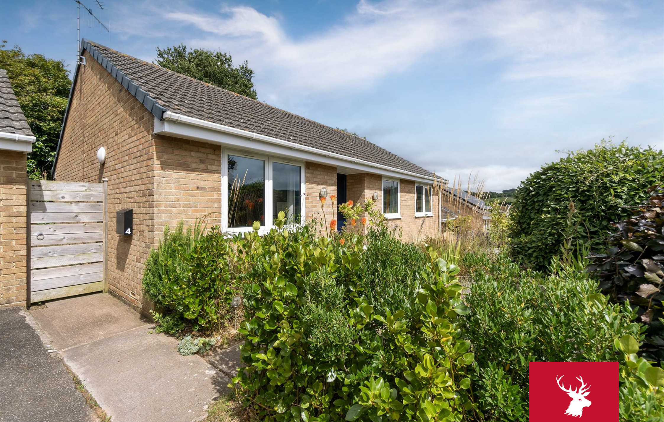
4, Lower Farthings