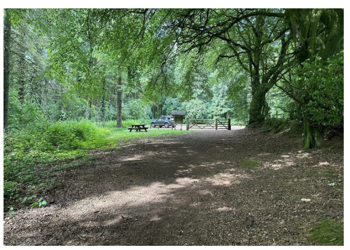
Honiton 4 miles Cullompton (M5) 7.1 miles