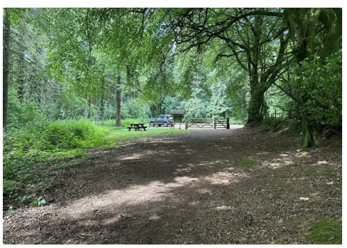
Honiton 4 miles Cullompton (M5) 7.1 miles