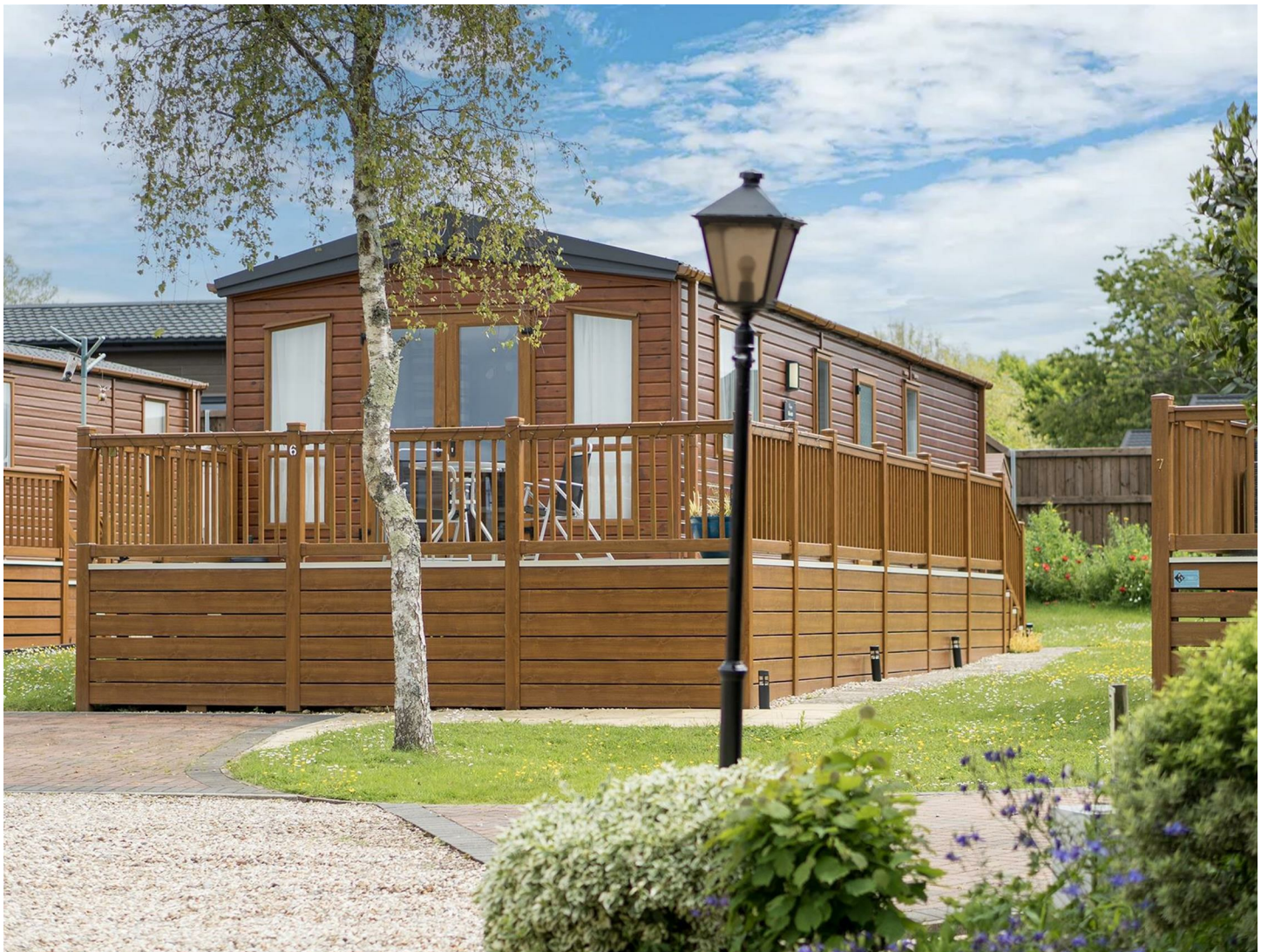
6, The Laurels