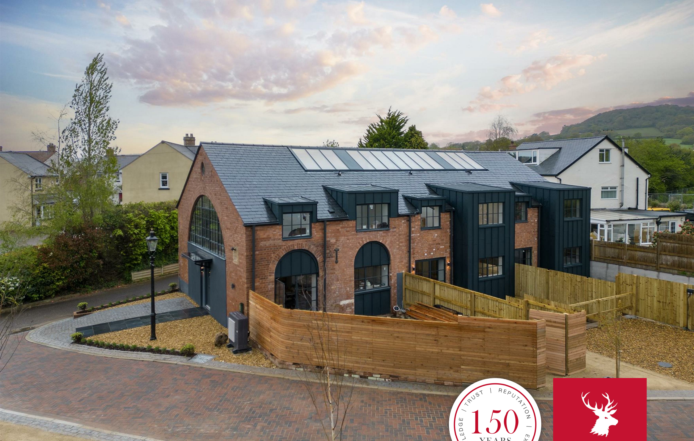
2, The Old Steam Laundry