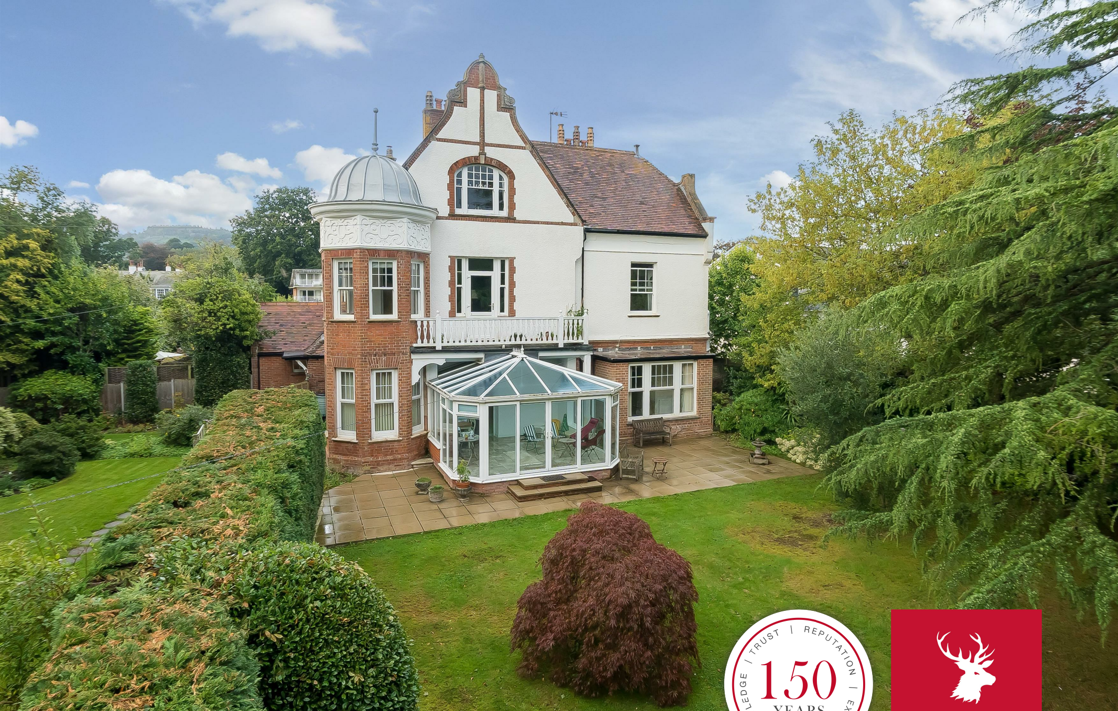
Flat 3 Grey Turrett,