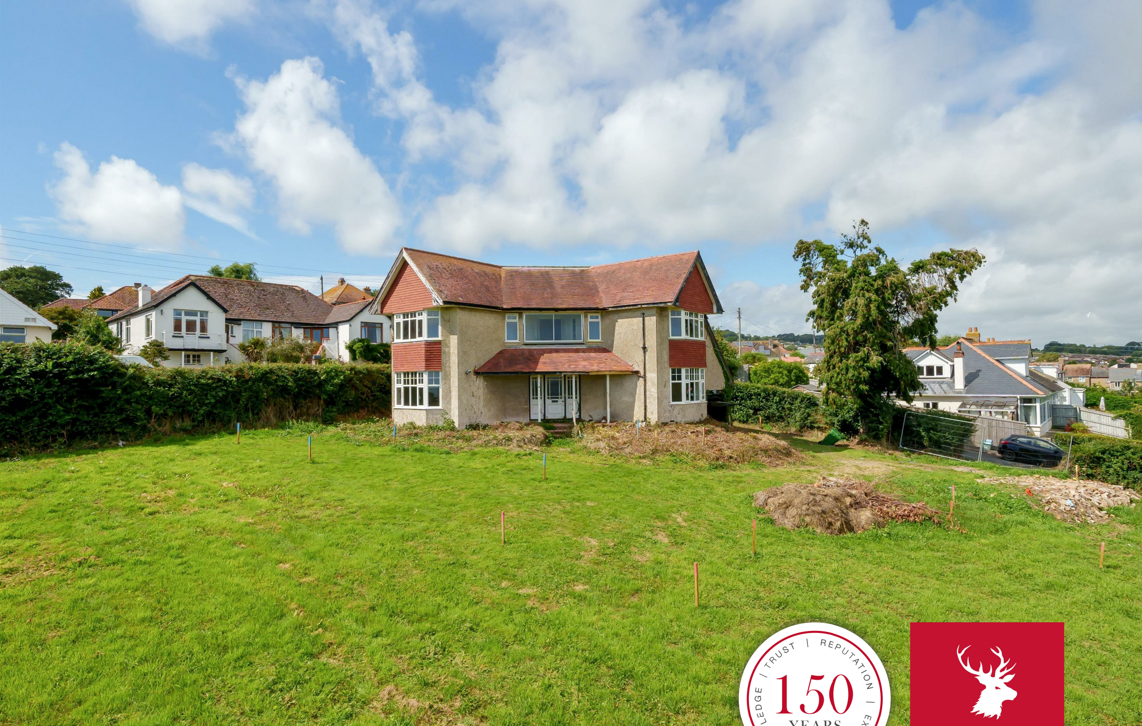
House and Plot at 15 Townsend Road