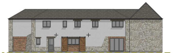
PROPOSED EAST ELEVATION. SCALE 1:100