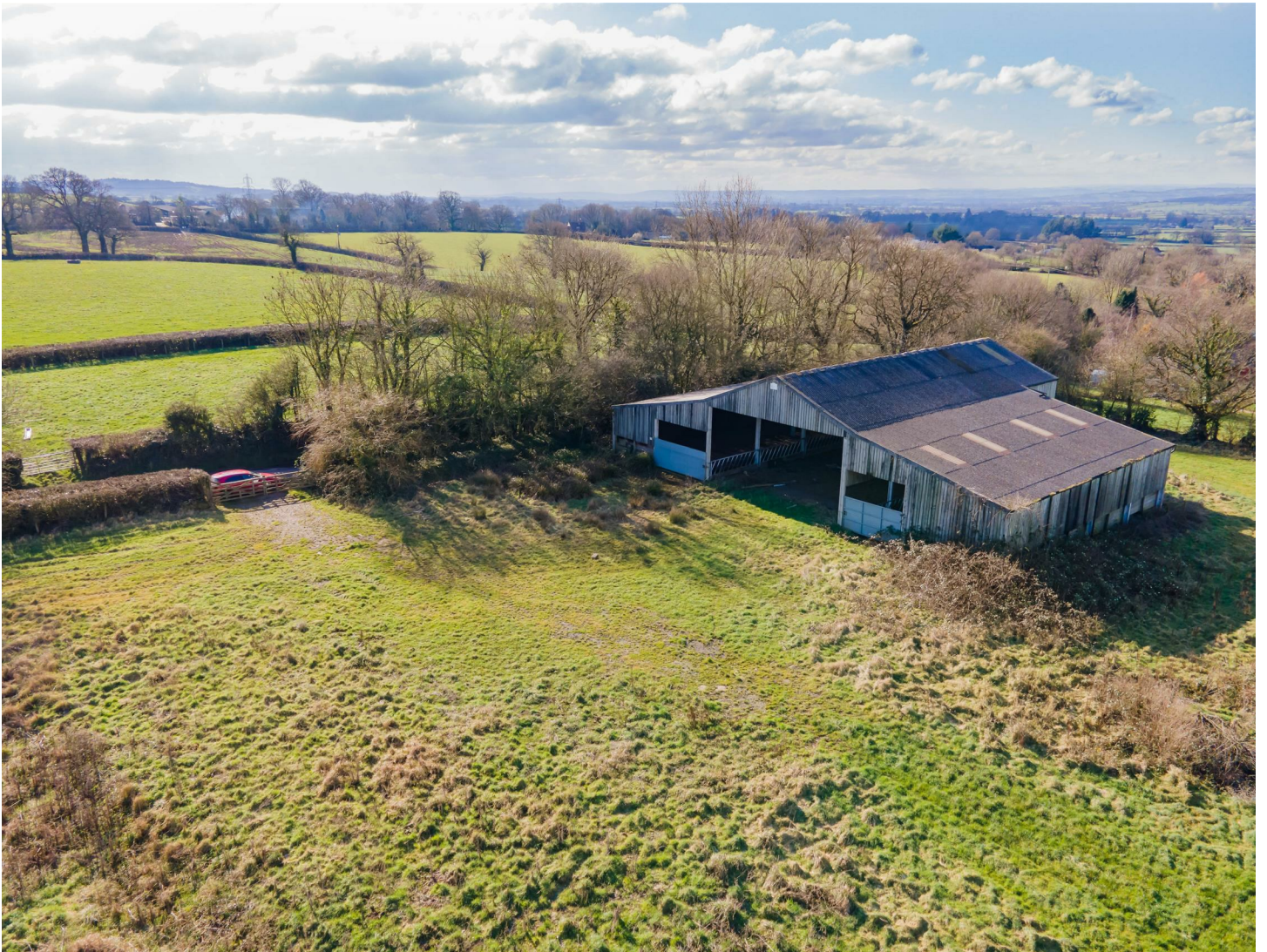
Barn at Talehead