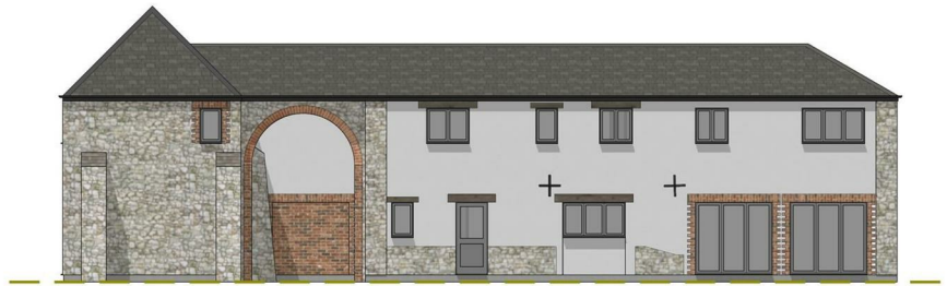
Proposed Elevations For Identification Purposes Only