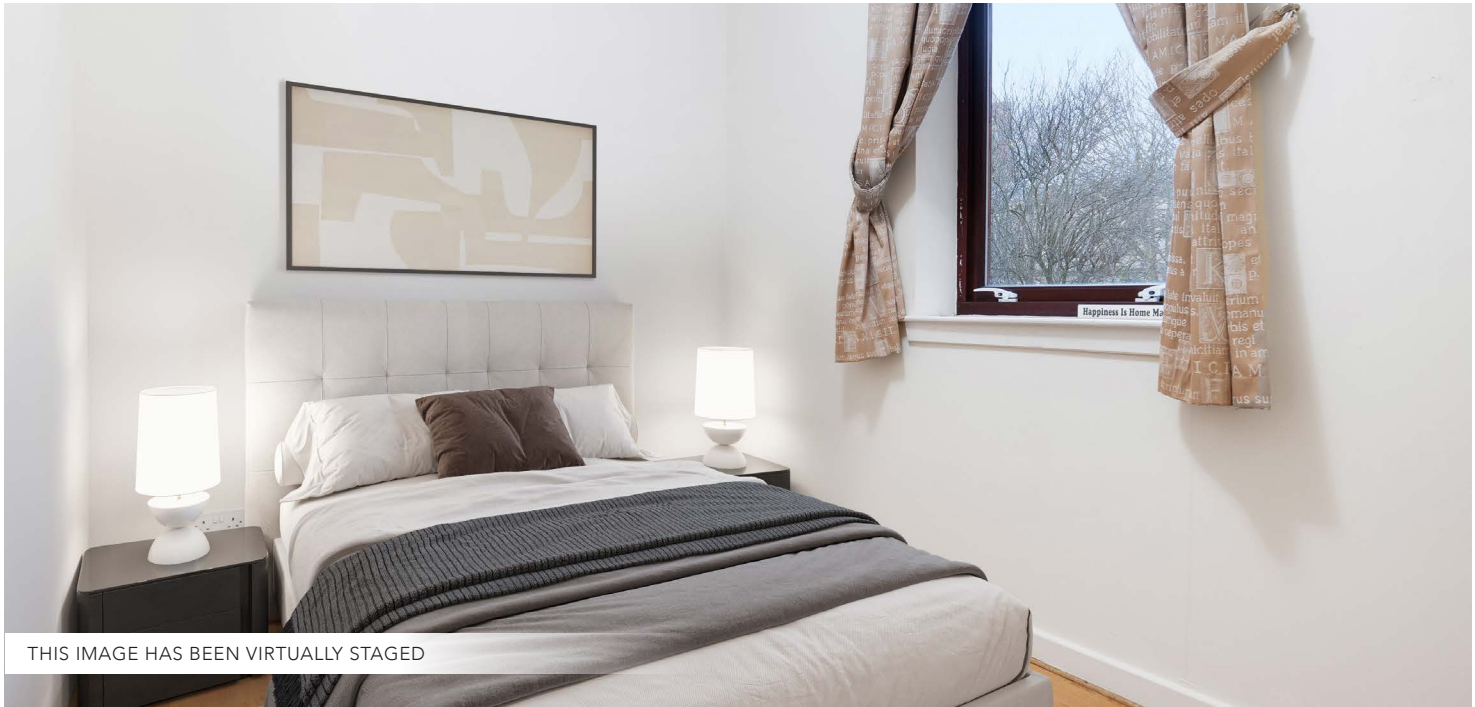
THIS IMAGE HAS BEEN VIRTUALLY STAGED