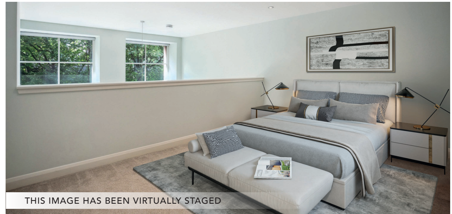
THIS IMAGE HAS BEEN VIRTUALLY STAGED