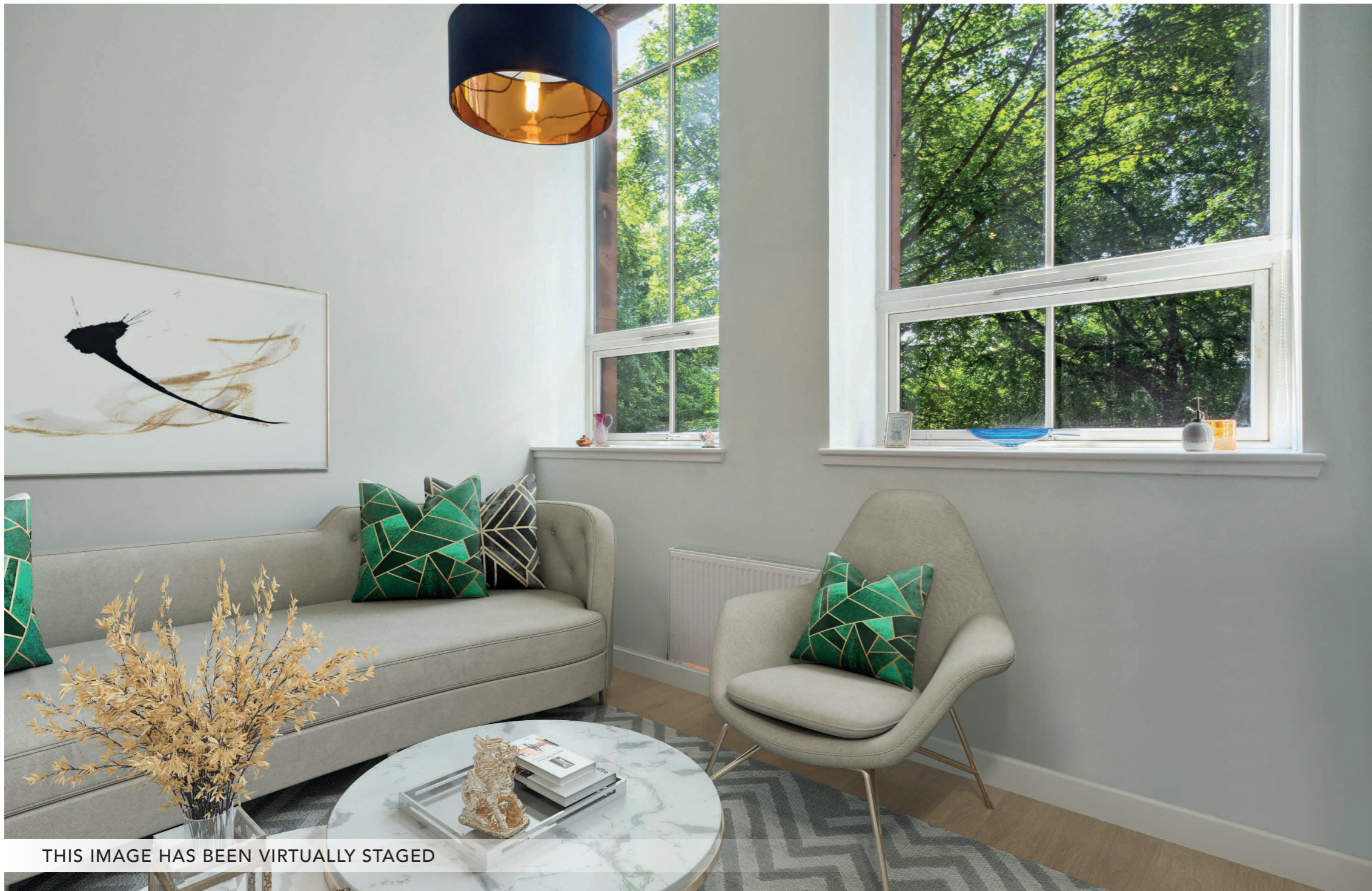
THIS IMAGE HAS BEEN VIRTUALLY STAGED