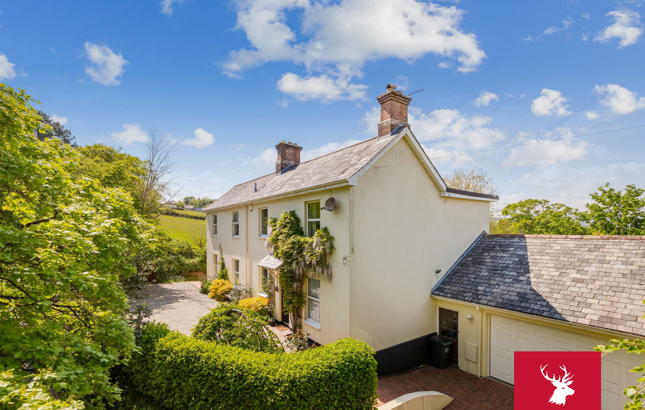
Loady Park House