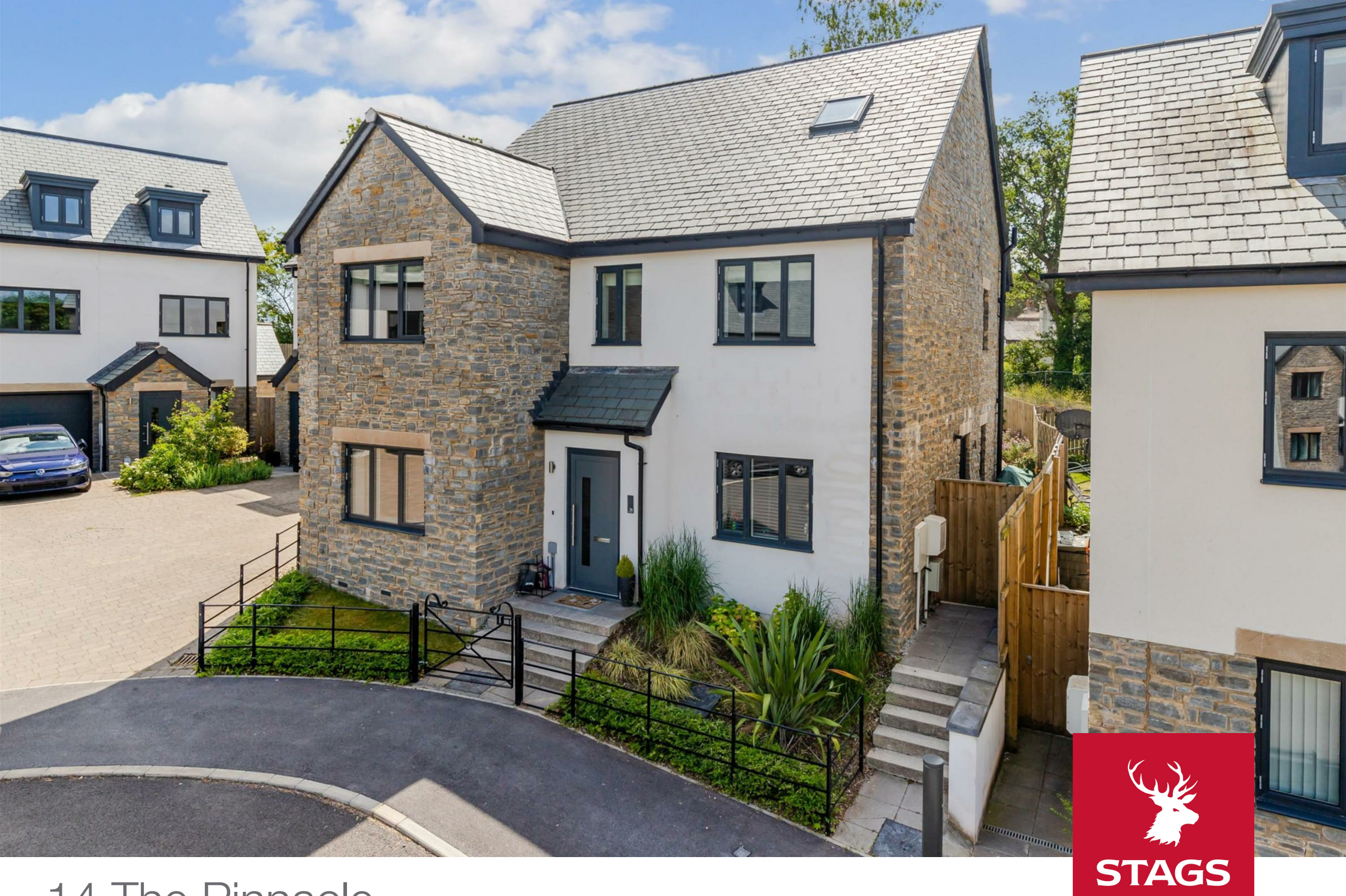
14 The Pinnacle