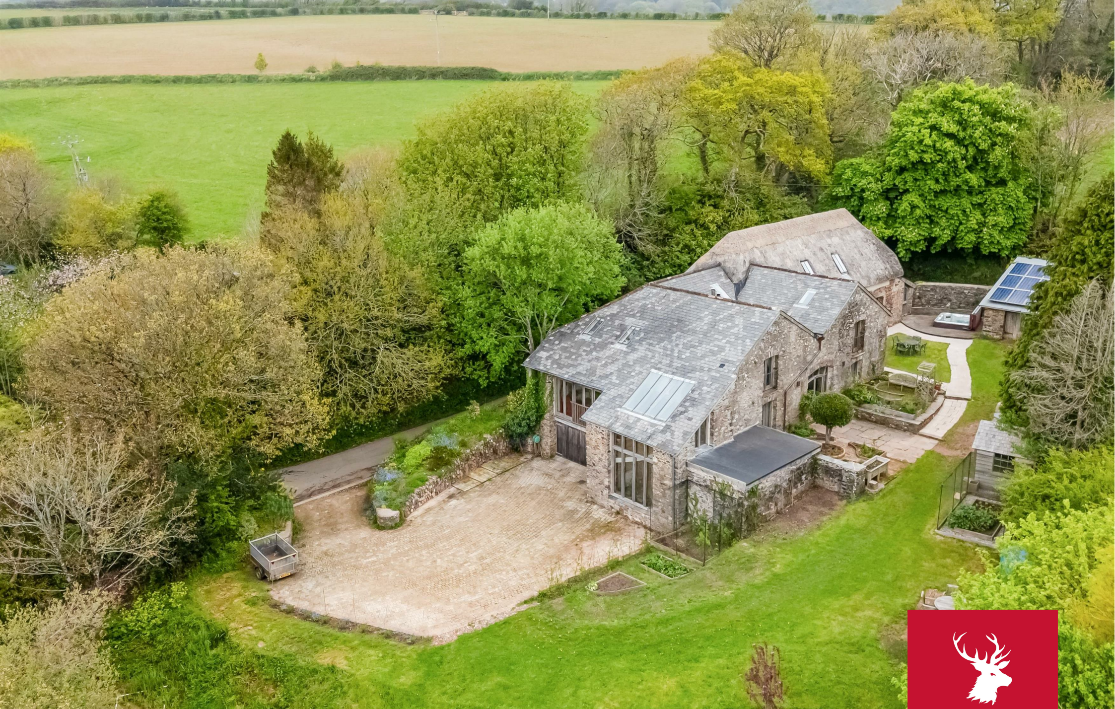
Green Dragon Barn