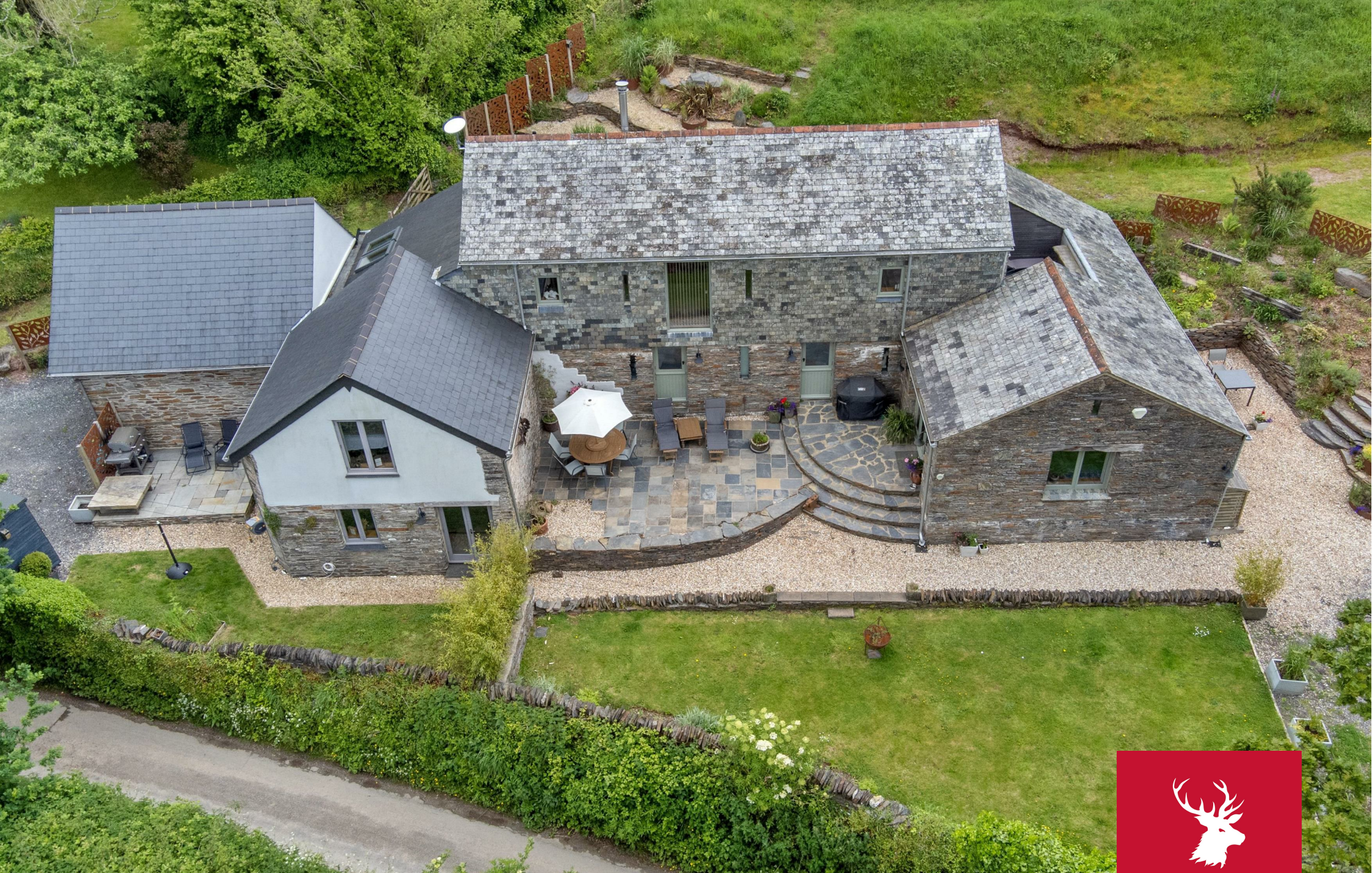
Monkey Oak Barn and Annexe