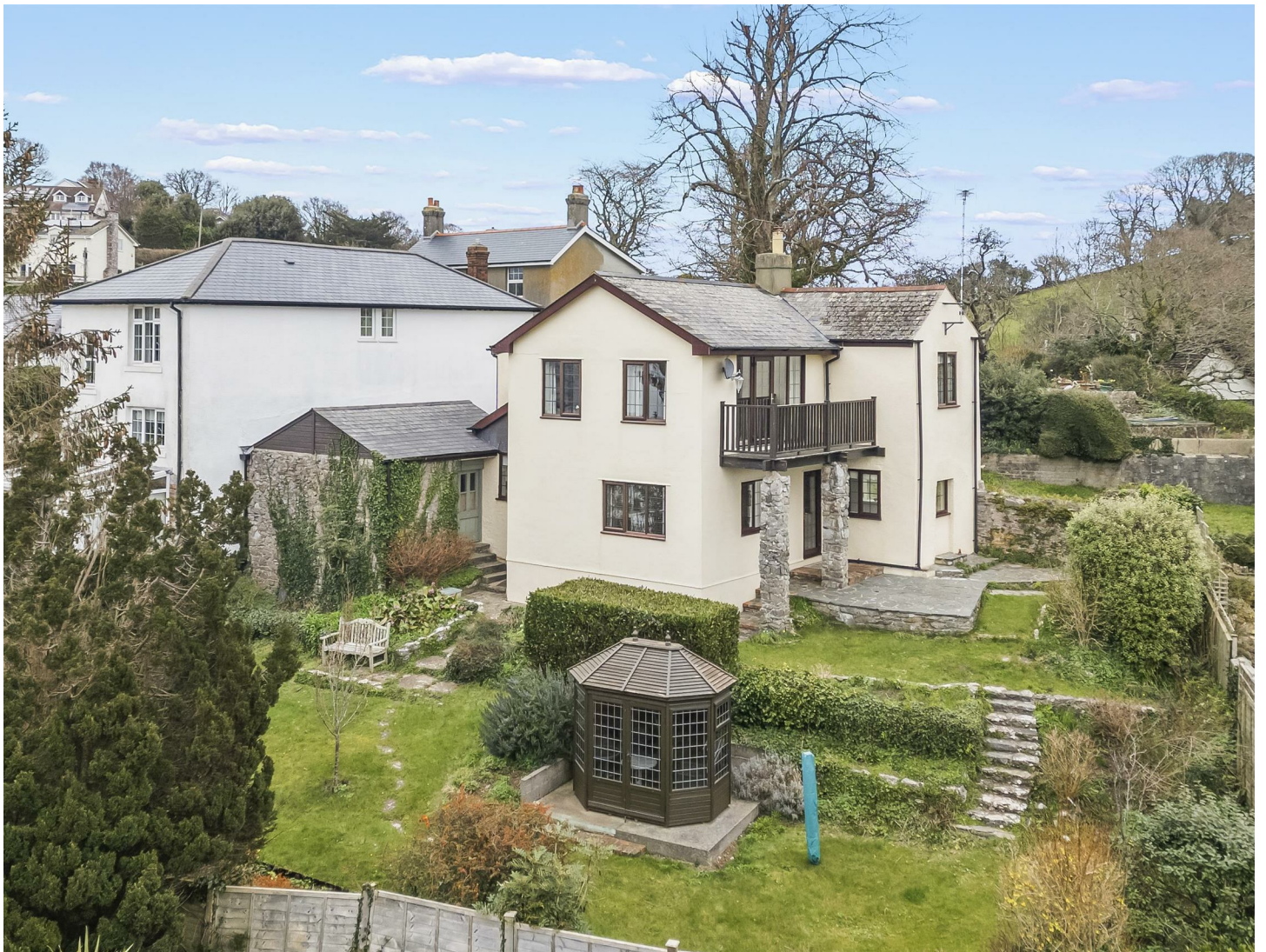
Stoke Hill Cottage