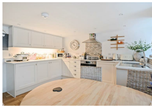
Dittisham 2.7 miles; Totnes: 5 miles, Dartmouth: 7 miles, Blackpool Sands: 8 miles