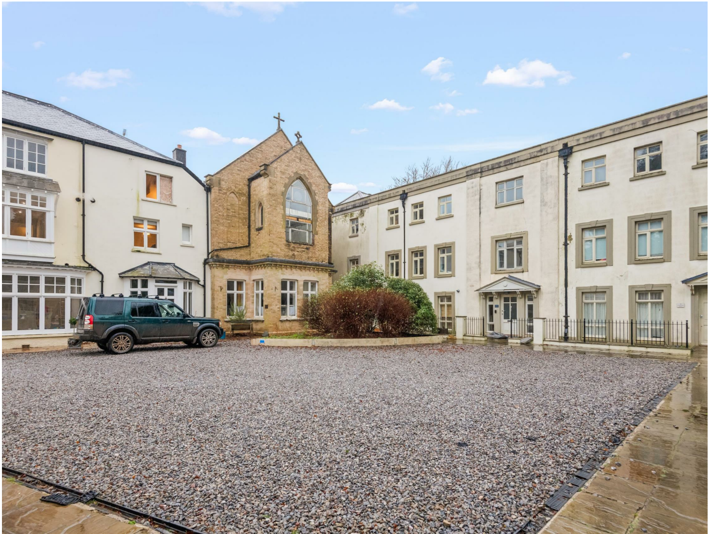
5 Dundridge Court