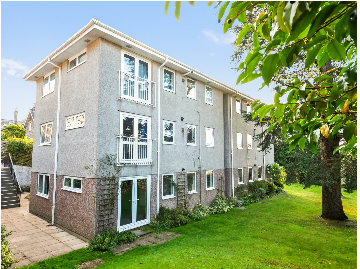
Flat 2 The Cedars