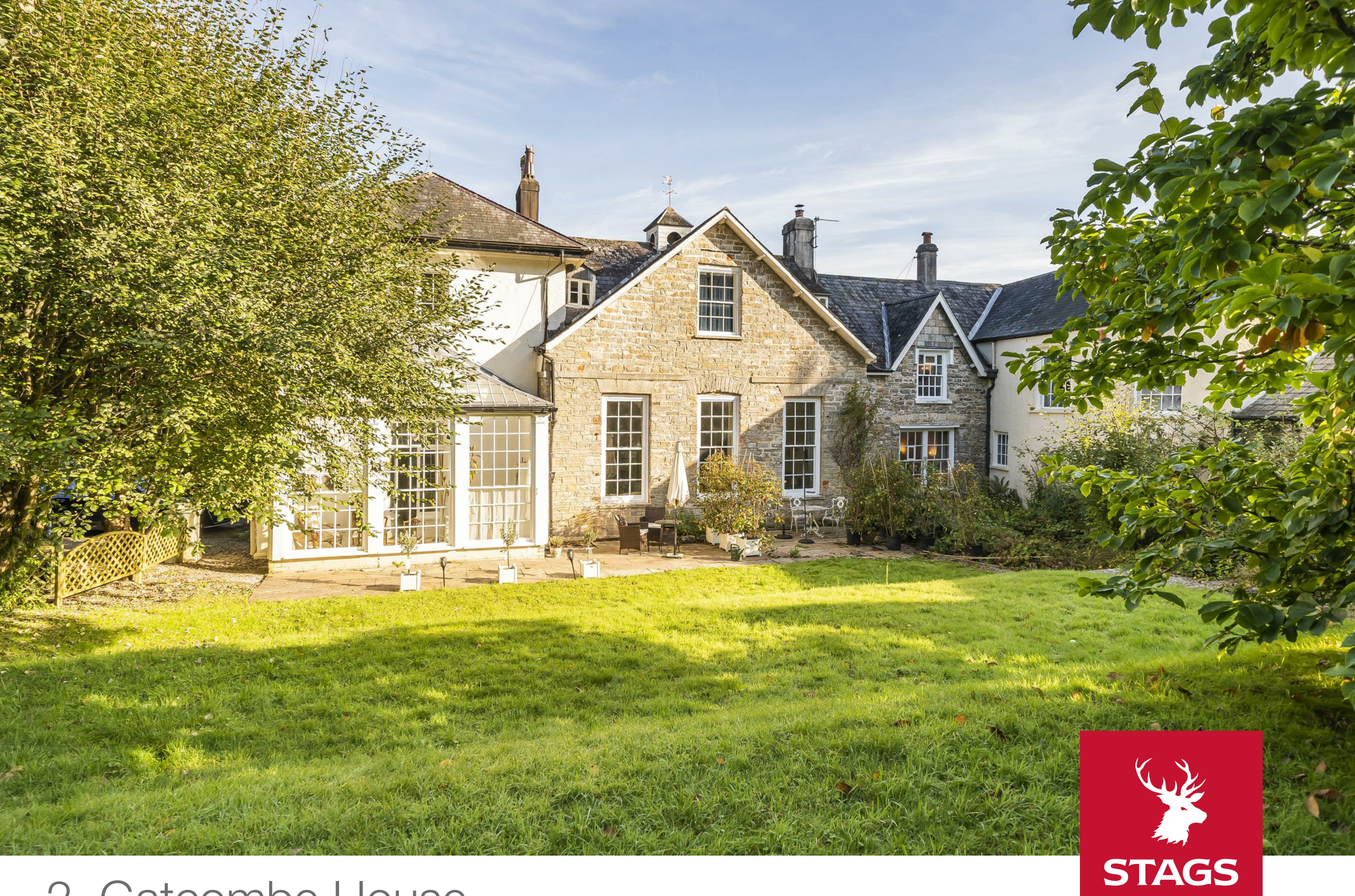
2, Gatcombe House