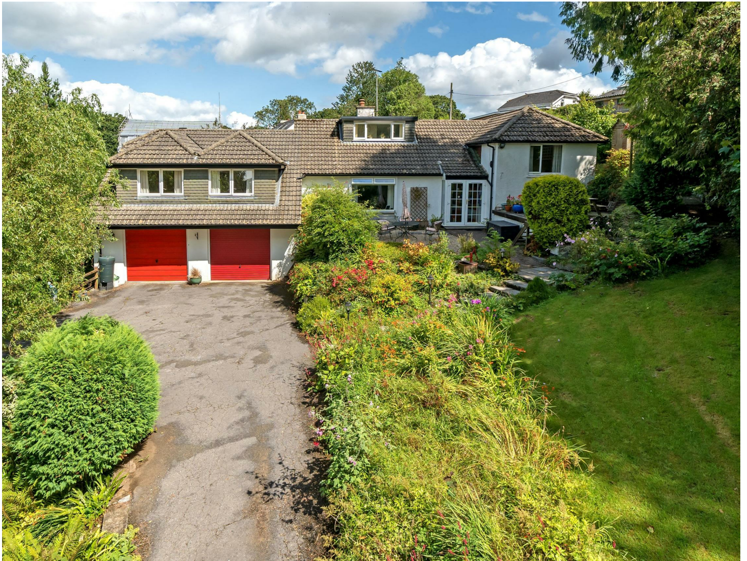
Redlake Cross Cottage