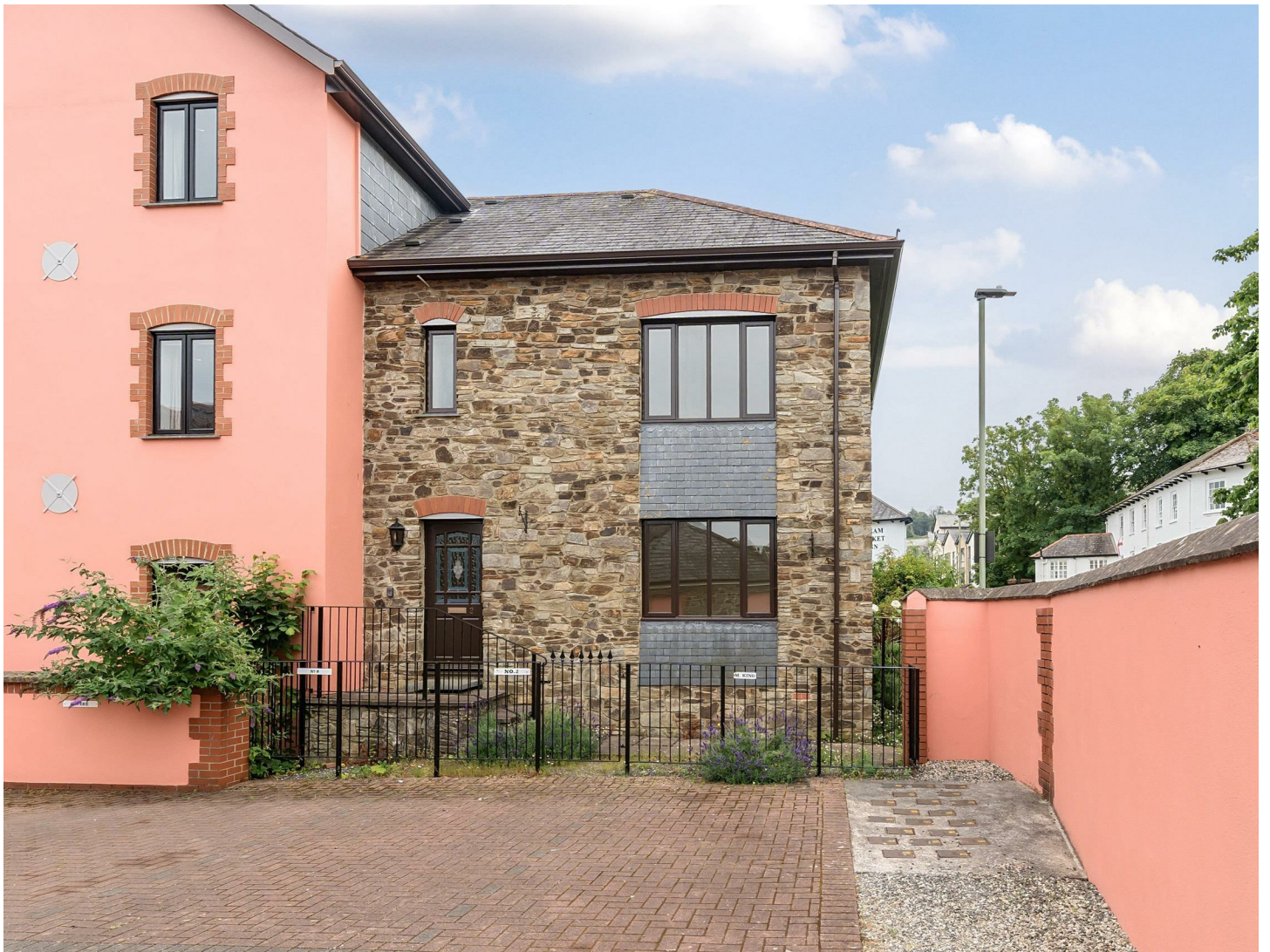
2 Throgmorton House