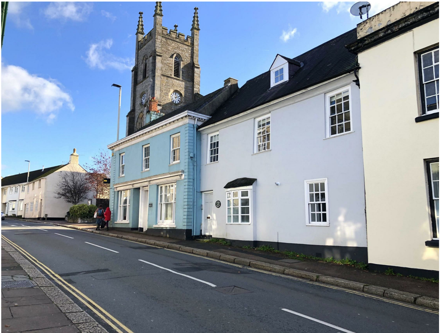
Flat 3 Sefton House