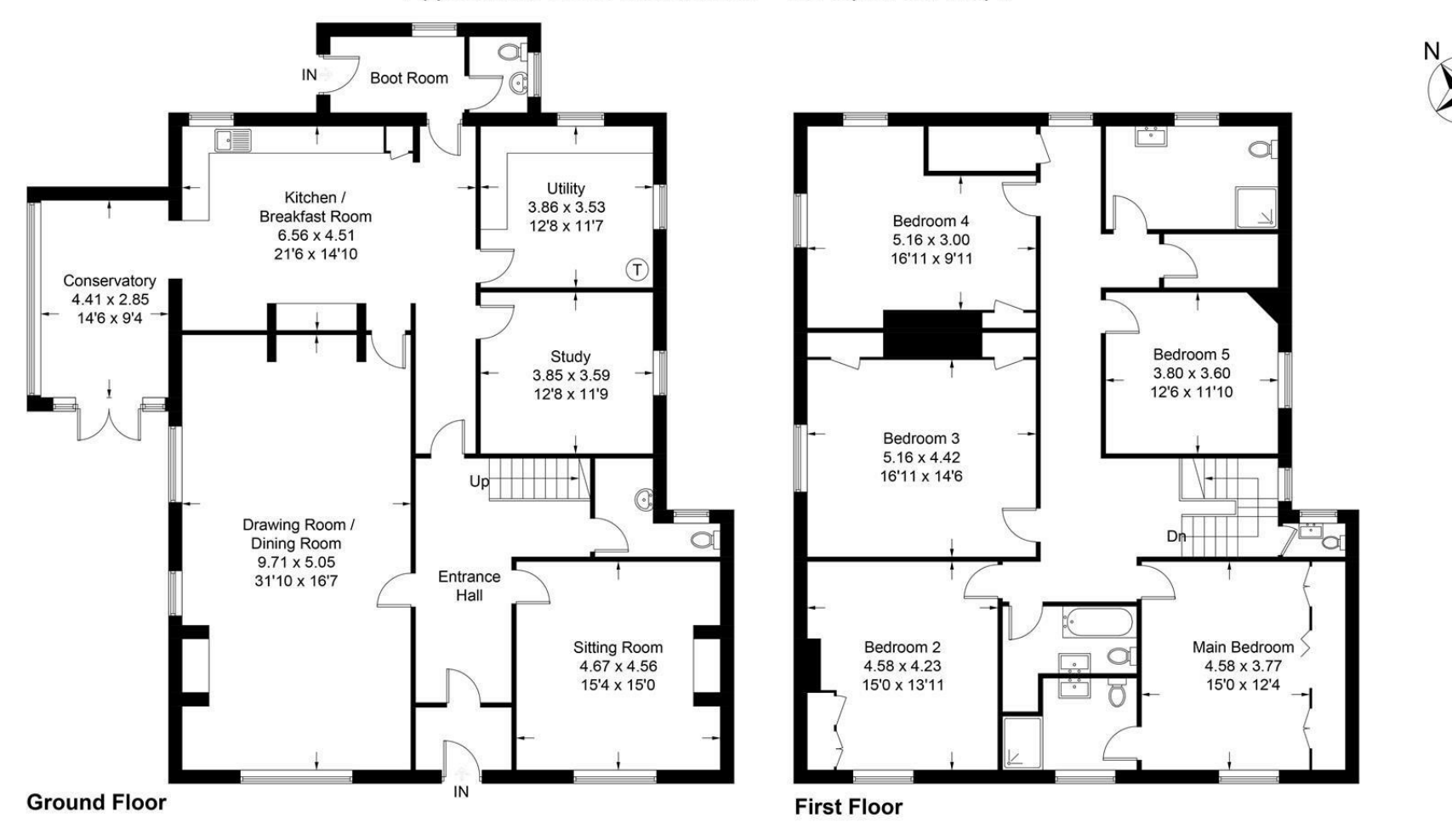
Approximate Gross Internal Area = 360 sq m / 3875 sq ft