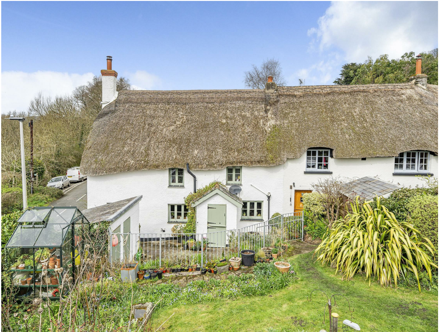
1 Atway Cottage