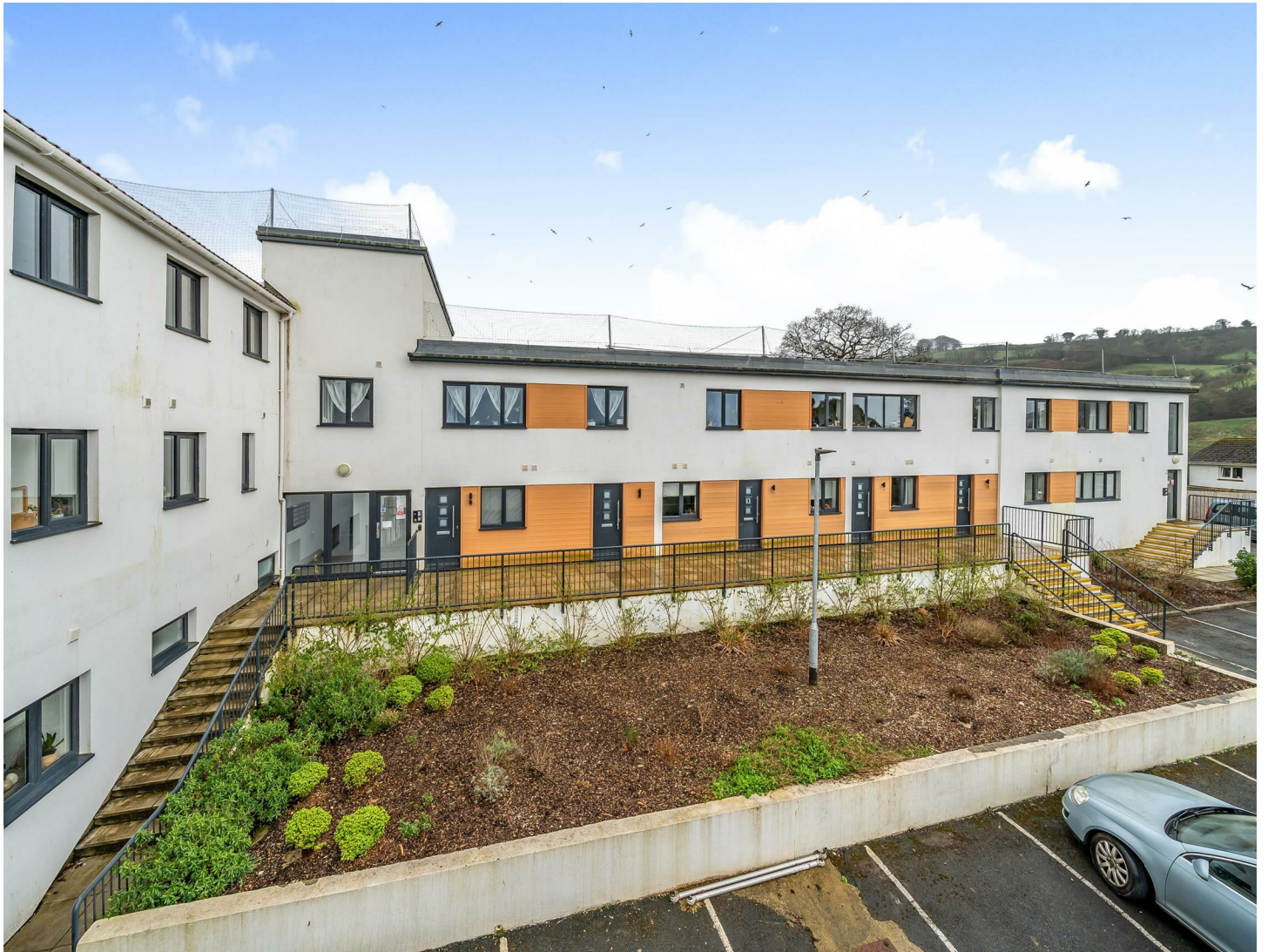
Flat 18 Rainbow View