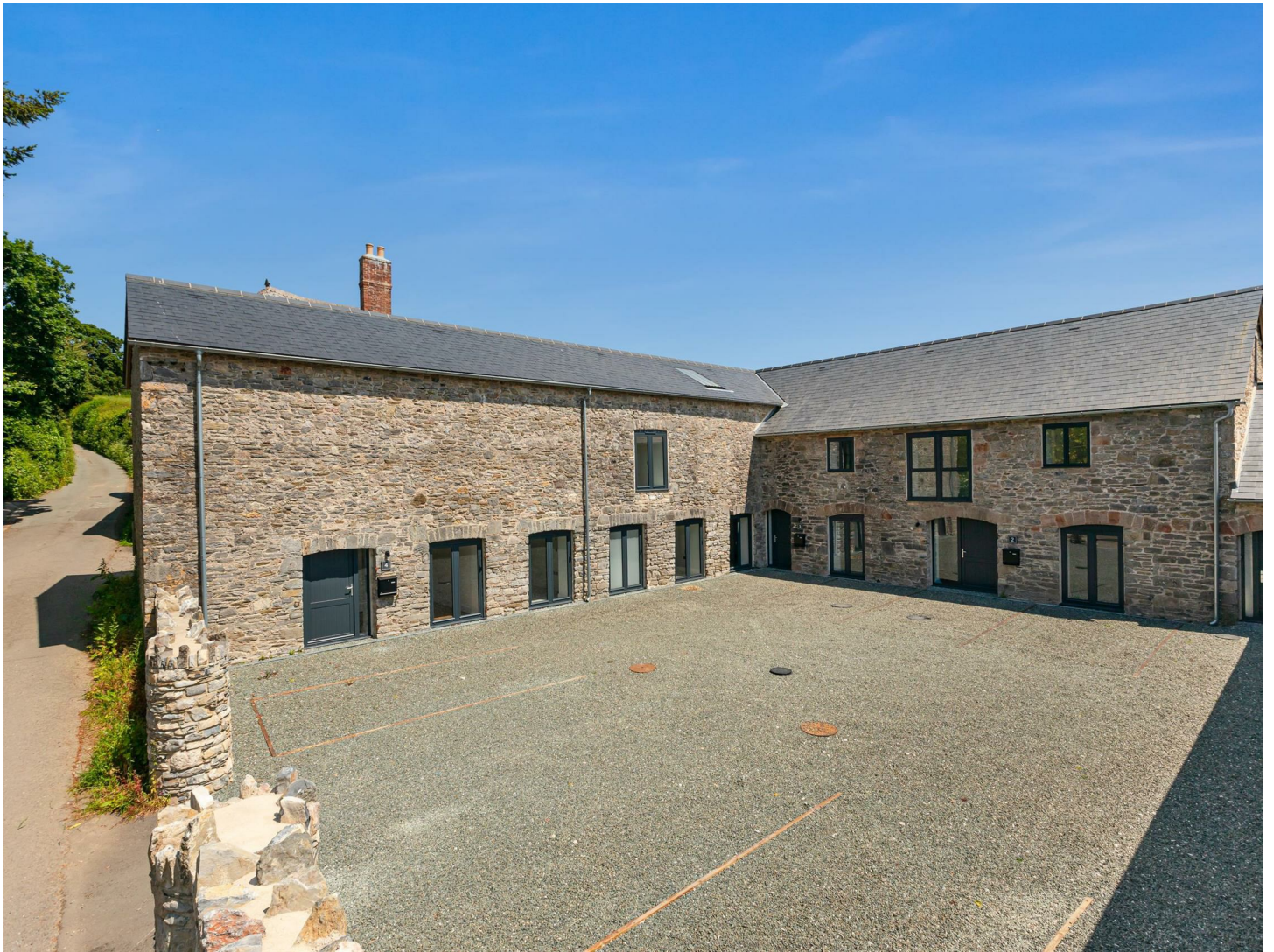
Woolbrook, Higher Court Barns,